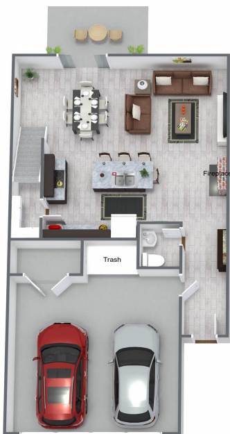
Emerald Townhomes Unit B 1st & 2nd